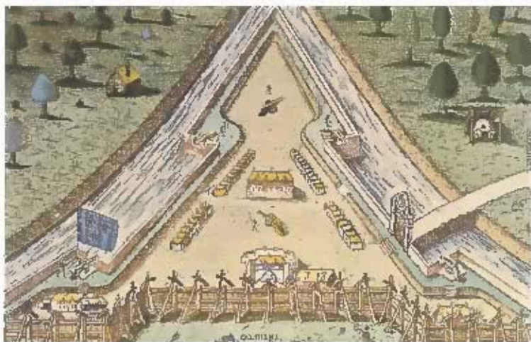
Fort Caroline, 1564-65

These French adventurers prompted Spain to accelerate plans for colonization. Pedro Menéndez de Avilés hastened across the Atlantic, his sights set on removing the French and creating a Spanish settlement. Menéndez arrived in 1565 at a place he called San Agustín (St. Augustine) and established the first permanent European settlement in what is now the United States. He achieved his goal of expelling the French, attacking and killing all French settlers except for professing Roman Catholics and non-combatants. Menéndez captured Fort Caroline and renamed it San Mateo.